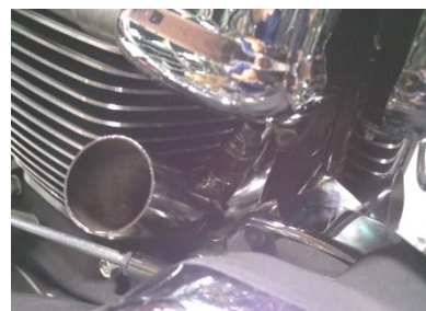
Fig 1.5 install crossover pipe

Note: use good and safe practices when removing and installing your new exhaust system to prevent injuries that includes but is not limited to such safety glasses and gloves. When installing make sure gloves are not abrasive or damage may occur like scratching parts. Always secure motorcycle before any work is done.