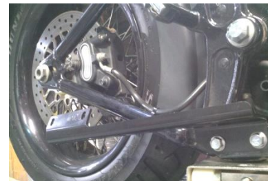
Fig 1.1 install right side bracket MBK-S111