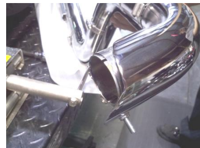
Fig 1.8 install clamp as shown on left side pipe bolt must face towards the engine to be able to be tighten

20. It is vital when installing a new chrome exhaust system; please make sure that your hands are clean with no oil. Right after installation is done, in detail, clean your new exhaust system with a soft cloth (to prevent scratches) and you could use the following (chrome wax, glass cleaner, alcohol, or ammonia before starting the engine.