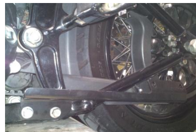
Fig 1.2 install left side bracket MBK-S110