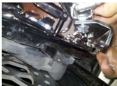
Fig 1.4 attach header to engine port and mounting bracket with 3/8 carriage bolts