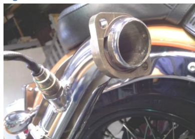
Fig 1.3 install flange and retaining ring