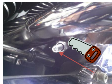
Fig 1.9 tighten T-bolt clamp and if you wish cut the end of the bolt threads flush with the nut

At freedom performance Inc. attempts have been made to provide enhanced concerning Clearances. However, due to some designs and space boundaries, ground and cornering clearance may not be improved and in some cases may even be reduced.